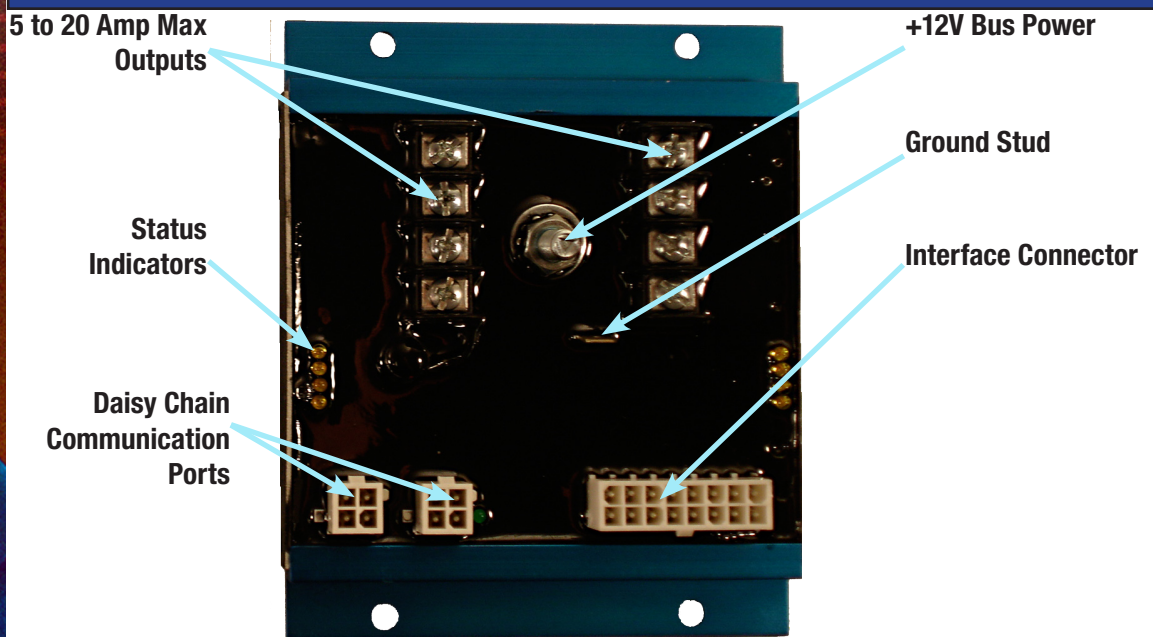
Eight Output 96 Amp [Max] Flex-Panel® Programmable Power Module.

The Flex-Panel® system from Wired Rite is a complete solution for custom vehicle wiring, and is installed as an overlay to the vehicle's pre-existing OEM wiring system. Flex-Panel facilitates the addition of electrical accessories including lights, electronics, and other equipment, and provides smart control of all accessories for safe and reliable operation.